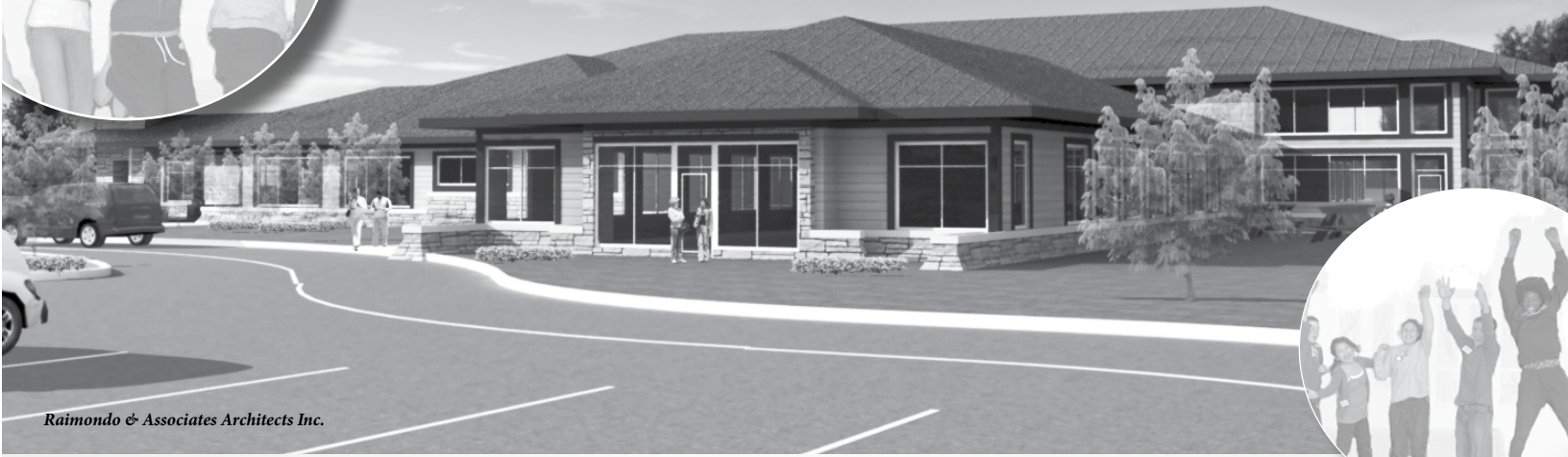
Raimondo & Associates Architects Inc.